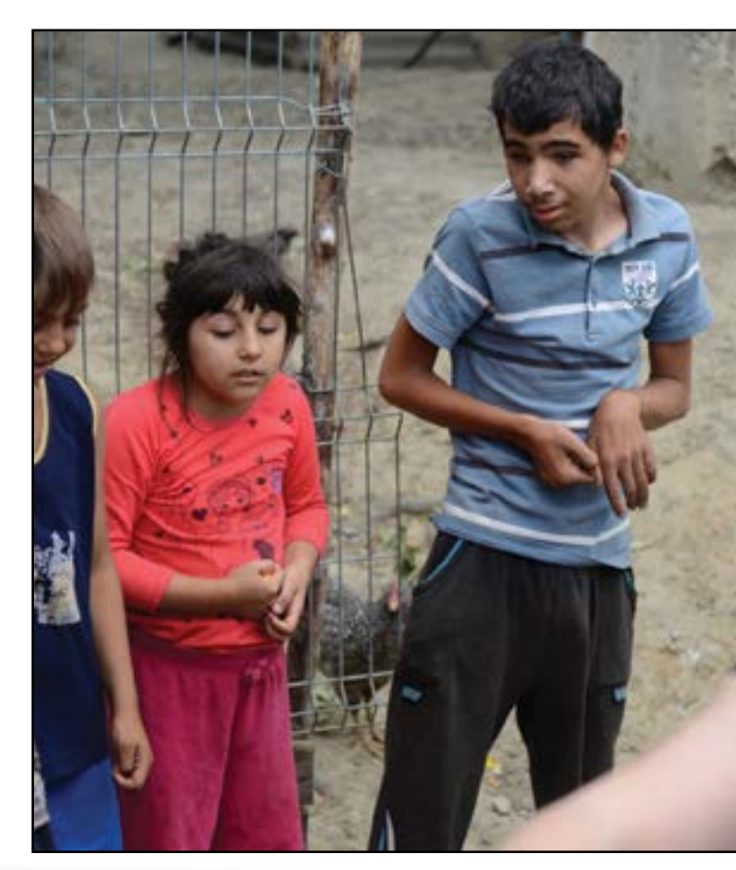
..Continued on page 10

One girl, appearing to be blind and mentally challenged, clutches the candy I put in her hand and then shyly stuffs it into the pocket of the teen boy with cerebral palsy standing next to her. My heart is broken to see these impoverished children who are not able to follow with the other children.