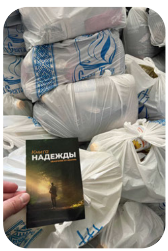
The Gospel of John

This very passage could be the motto of the church in Ukraine. Though facing this generation's greatest challenge, they persevere through God's grace. They carry on with the work knowing that God will continue to build His church until the day when His own will be glorified.