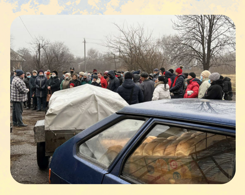
1 Cor 12:26a If one member suffers, all the members suffer with it.

I will never forget the evening of February 23rd, 2022 (the early morning of February 24th in Ukraine), when breaking news came on and reports on the beginning of a large-scale Russian attack were coming in. At that moment, I was overwhelmed with two emotions: grief for the people I have come to love and intense gratitude for Providence in establishing channels through which we can continue to help those in the hardest-hit areas of Ukraine.